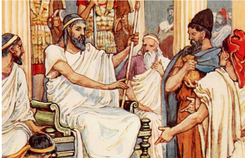
Figure 2: Solon, The Archaic Lawgiver.

The Athenian Constitution Details Solon formed a new type of assembly i.e. Ekklesia with the incorporation of all the citizens. It is a bold move during those days. The Jury also consisted of some of them sitting together. The foundation of Authentic Republic was laid with this; the voice of the people got heard and accountability also mounted on officials. There was a council of 400 selected among the tribes as the steering committee for the Ekklesia. Although this is a type of debate among the scholars specially regarding the representation of the thetes yet the significance of the step cannot be denied as it had potent reflection in the archaic Greece.